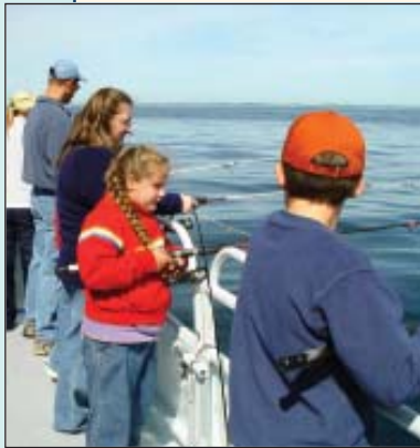
Kids learn the excitement of mackerel fishing off the N.H. coast.

Based in Portsmouth, CCA-NH is involved in many restoration projects along New Hampshire's seacoast, from working on salt marsh restoration to serving as a watchdog on pollution issues affecting Great Bay and the coastline. Its vision is to first, protect the resource, then improve current and future fishing for everyone. Find out more about CCA-NH at www.ccanh.org .