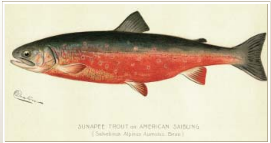
The Sunapee or golden trout (a char) was also originally present in several other New Hampshire and Maine ponds. It disappeared from Sunapee around the middle of the 20 th century and is now found only in Maine.

Brook trout were historically far more common in state waters than they are today. Many lakes and ponds that now hold bass and pickerel were originally brook trout waters, including Lake Sunapee and Lake Umbagog. In a common pattern, many of