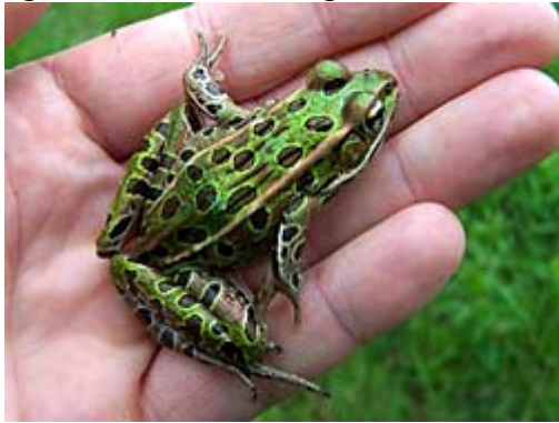
Northern Leopard Frog

We need verified reports of Leopard frogs ; photos are crucial!! Most reports of Leopard frogs turn out to be Pickerel and green frogs. Focus searches during late summer in floodplains, fields, and agricultural areas along rivers. See the NHFG website for description of species.