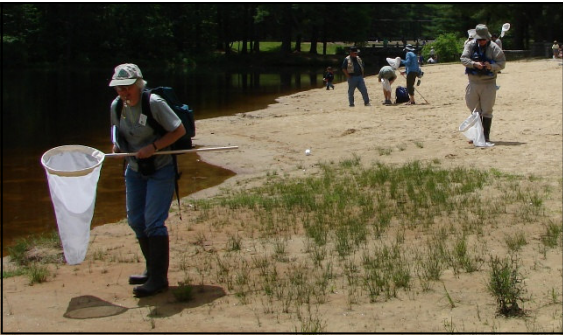
Participants in a 2007 workshop at Bear Brook State Park

The NH Dragonfly Survey started in 2007 as a partnership of NH Audubon, NH Fish and Game, and UNH Cooperative Extension. Its goal is to gain a better understanding of the distribution of dragonfly species of conservation concern in New Hampshire. Volunteers can participate by attending an introductory workshop that will train amateur citizen scientists (that's you!) to collect data at priority habitats and poorly surveyed parts of the state.